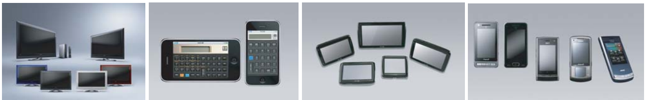
モニター液晶, 携帯電話液晶, 計算機液晶, ナビゲーション液晶などフィルム, Glassフィルム接合